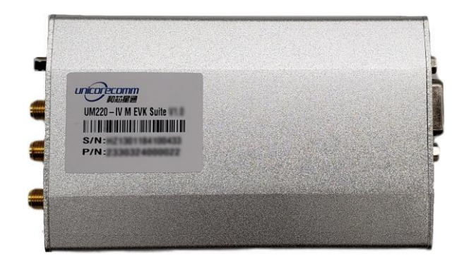
Figure 2-1 UM220-IV M0 EVK Suite

The figure below shows the appearance of UM220-IV M0 EVK Suite.